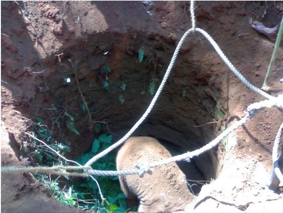
Snoozing with caution-traditional method