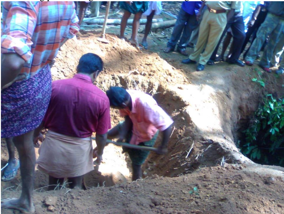
Making side earthen ramp to open out well