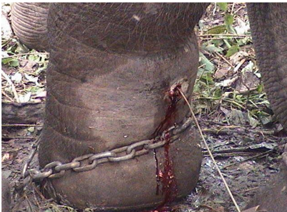
Bullet wound with inflammatory swelling on palmar aspect of pastern joint being probed in search of bullet