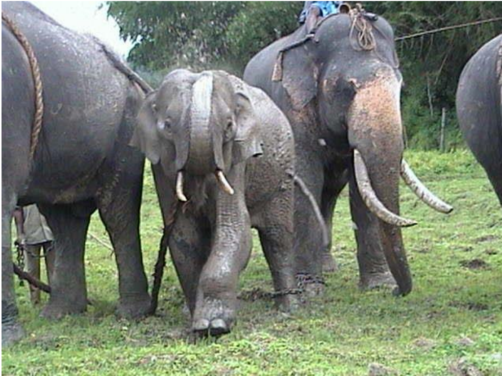
Injured sub-adult tusker captured by snoosing