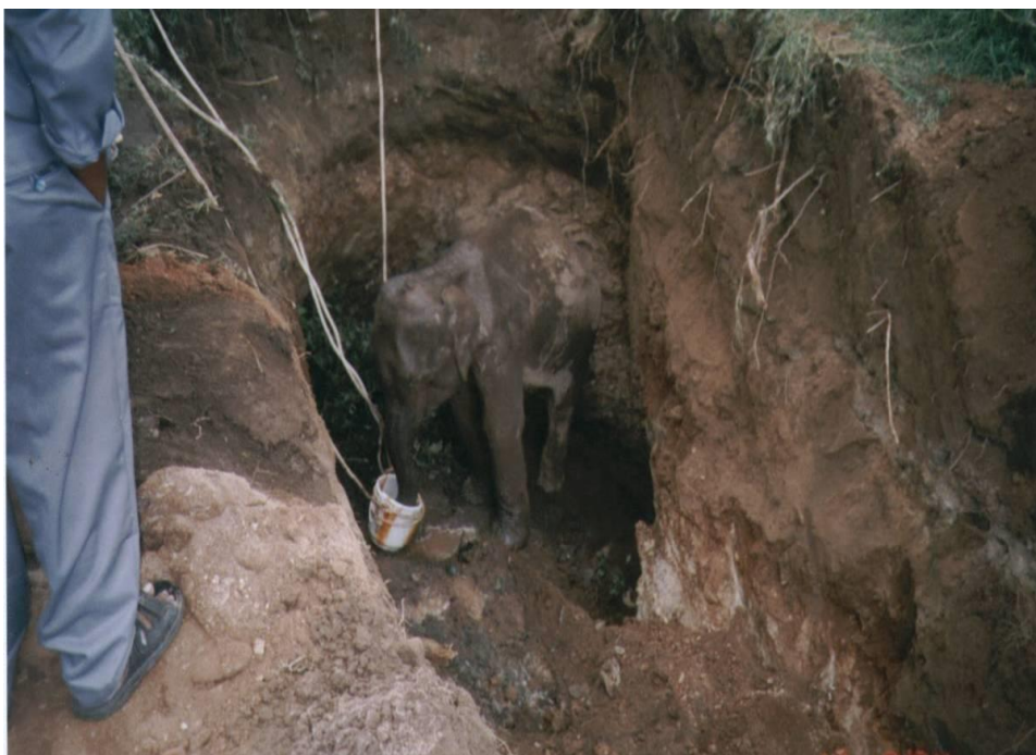
Watering with re- hydration salt