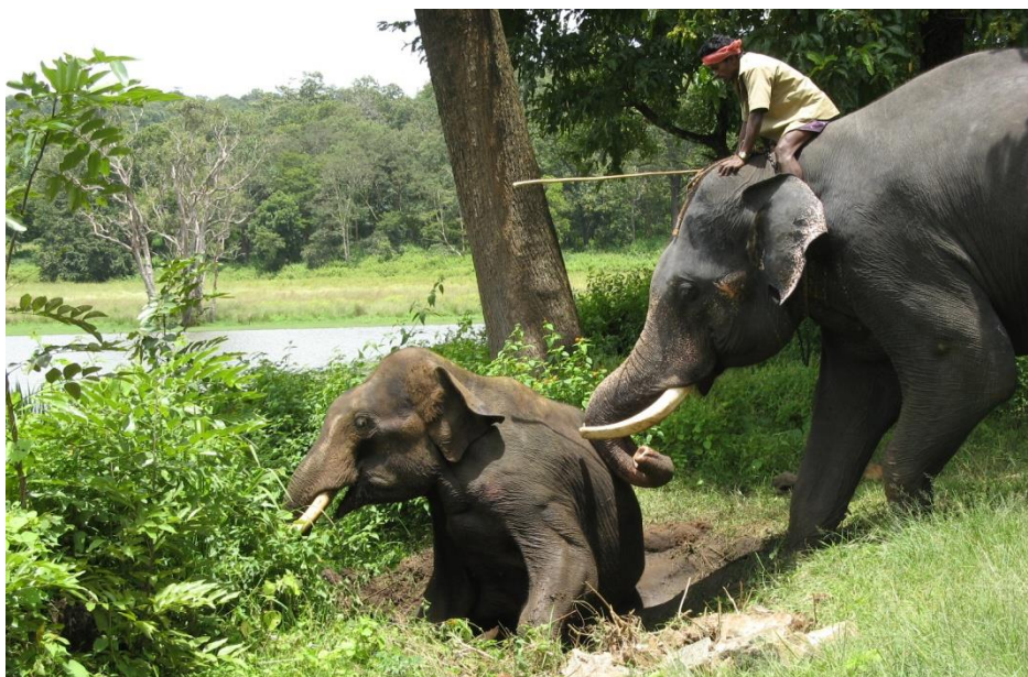
Kumkies lifting to get up from the pit