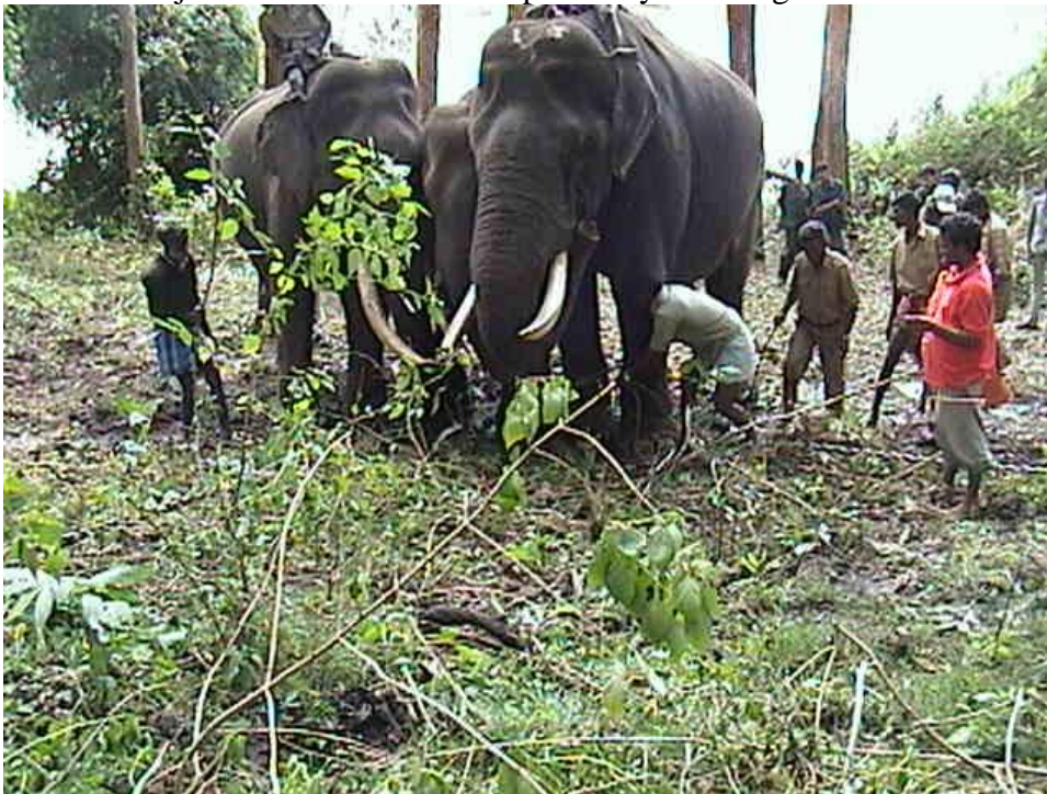
Elephant restrained in between two kumkies for the treatment