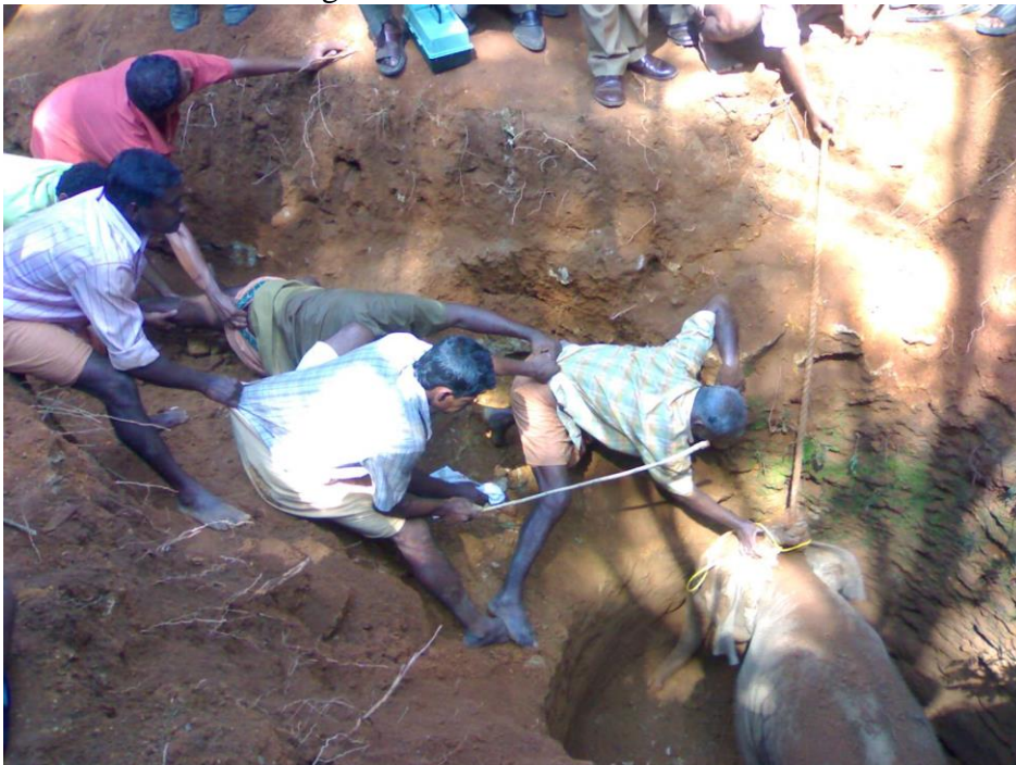
Securing noose- traditional approach