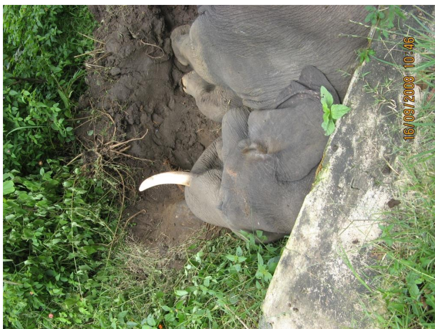
Tusker wedged between concrete wall and root

elephants for rescue operation. The Kumkies placed at a distance standing to safe guard the workers as well as to reassure the distressed elephant, which the workers broke the wall and released the head of victim elephant. Once the head was released, the elephant moved its tusk, and did not make any attempt to get up. Being a large tusker, it was not possible for the people to lift the elephant. Therefore a kumkie was used to nudge and lift the elephant successfully. The tusker then stood for about 5 minutes before being able to and driven away by the kumkies in to the jungle.