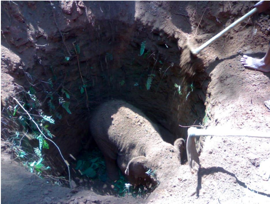
Closing pit with vegetation with surrounding vegetation and soil to reduce the depth