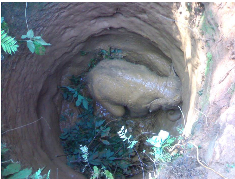
Elephant trapped in deep abandoned well

The possible way for saving the elephant calf was identified to fill the bore with soil and nearby and then elevate the well height, thus reducing the ground height. Then the elephant is it appropriate were began to make a noose to fit around the calf's neck with a locking system so as not to strangle the elephant. While stretching its trunk, the noose was slipped around the elephants' neck and a second noose around its hind foot. With this nose the elephant was pulled out of the pit as the well was partially tilled and a with ramp had been created . The elephant was then treated for minor injuries.