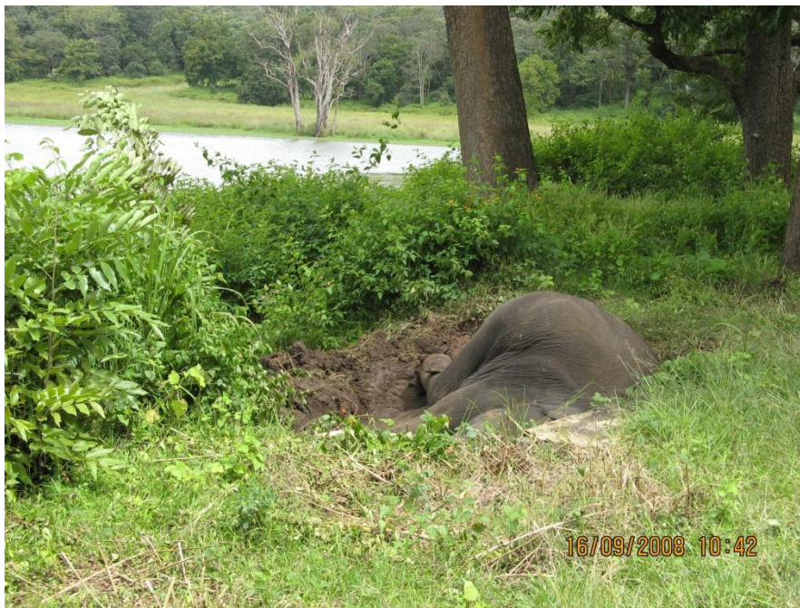
Tusker trapped in the concrete wall near waterhole