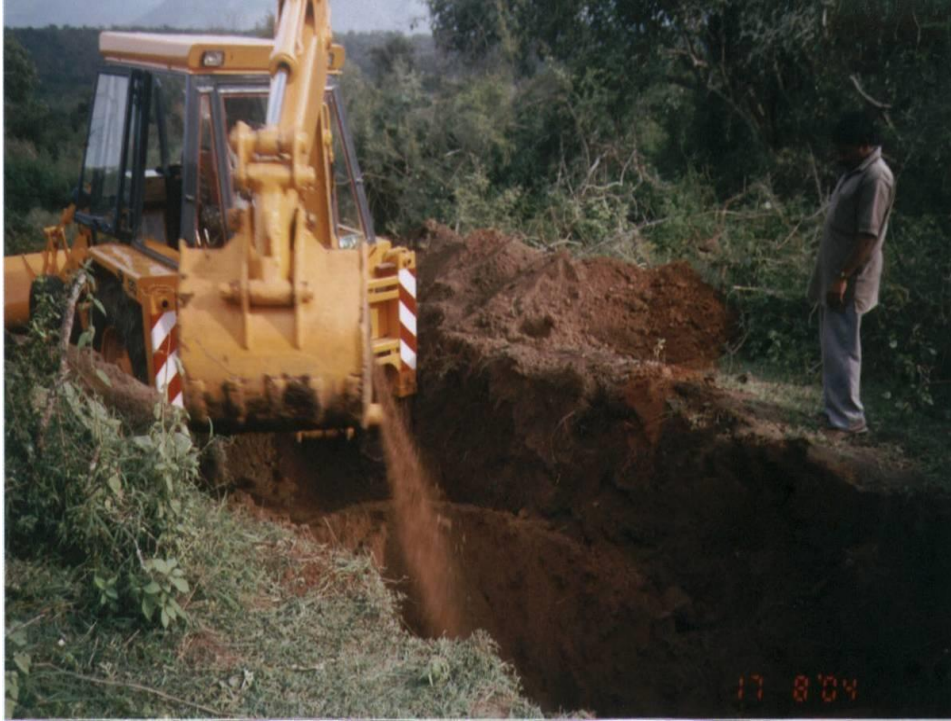
Earth mover making side earthen ramp